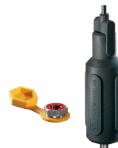
VIBCODE transducer with coded measurement location