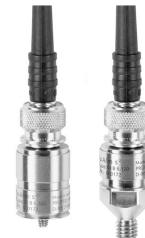
PRÜFTECHNIK industrial accelerometers for mobile & continuous condition monitoring.